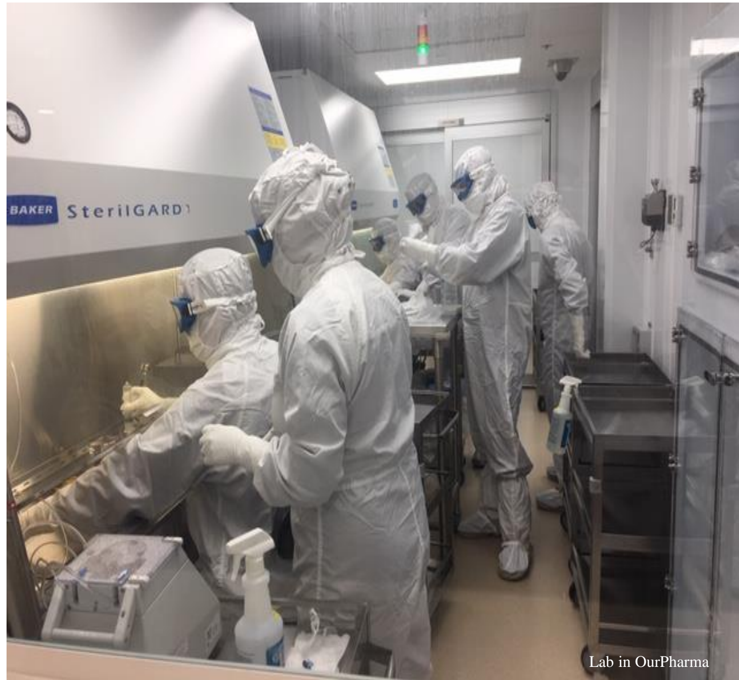
Lab in OurPharma